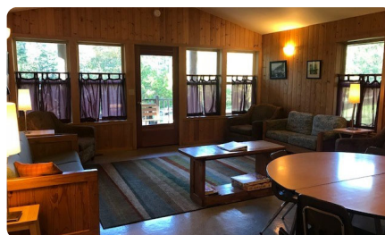
Dederer Center Interior