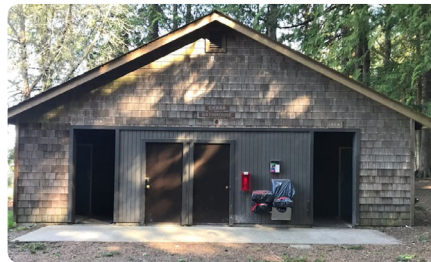
Main Camp Bathrooms & Showerhouses