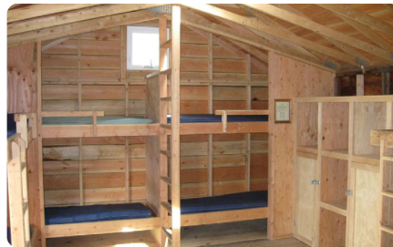
Typical Main Camp Cabin Interior

Main Camp cabins are more rustic, and are located on the beach or nestled among the trees. Fully enclosed, these house up to 12 participants in bunk beds, participants provide their own linens. Some cabins have electricity; bathroom facilities with showers are a short walk away. If you require electricity for medical reasons, please inquire about availability during registration.